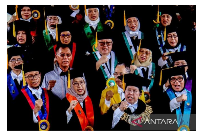
Figure 1: Documentation of the chairperson of the UI board of professors