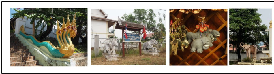
Figure 6: Naga and elephant art decorations in Luang Prabang