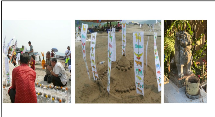
Figure 5: Tung in Luang Prabang traditions and Chinese lions at building entrances

Luang Prabang National Museum, represents the unification of Luang Prabang, Vientiane, and Champasak under a single rule. The Great Tiered Umbrella Buddhism highlighting its religious importance. Regarding rituals and ancestor beliefs, legends such as "Sing Kham" and "Sing Kaew" reflect the community's beliefs in ancestor spirits and guardian angels. The worship ceremony of Pu Yer Ya Yer during Songkran festival processions illustrates the community's relationship with protective deities and sacred entities. Animals are also featured in astrological beliefs, such as the twelve zodiac animals that appear in traditional ceremonies. In modern times, Feng Shui beliefs have influenced daily life, with Chinese lions often serving as guardians at doorways to bring good fortune, protection, and prosperity in business