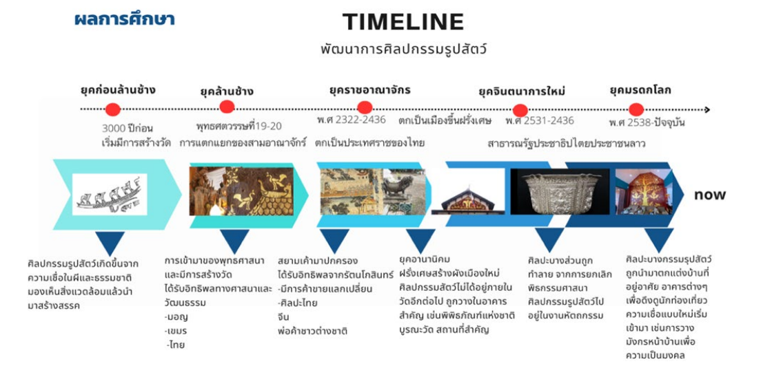
Figure 2: Timeline of the evolution of animal art in Luang Prabang

In Summary, in the pre-Lan Xang period, animal art reflected beliefs about spirits, nature, and tribal identity through symbols such as serpents and Nagas, which were closely tied to human life. During the Lan Xang period, these artistic expressions evolved with the influence of Buddhism and were shaped by Mon, Khmer, Lanna, and Chinese cultures. This evolution was evident in temples and religious buildings. After the French colonial period, animal art played a more significant role in decorating important buildings and handicraft products, such as silverware, supporting the tourism economy. Following the registration of Luang Prabang as a World Heritage site in 1995, these artistic expressions continued to develop through handicrafts and architectural decoration, reflecting the local identity and attracting tourists.