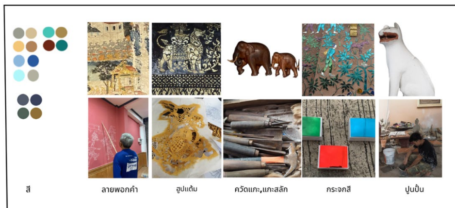
Figure 3: Techniques and colors of animal art in Luang Prabang

Colors: Animal art typically features red and black as base colors in the lacquer technique, with gold, black, and white predominant in 2D and 3D sculptures. Multiple colors appear in mural painting, primarily cool tones used with natural pigments. In government buildings, public parks, and residential areas, silver and gold predominate, along with natural animal colors and material colors such as wood tones and marble.