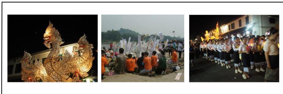
Figure 7: Animal art in traditions and rituals of Luang Prabang

Animal art in Luang Prabang is deeply connected to society through its traditions and rituals. This art form influences daily life, beliefs, folktales, legends, and religion, creating lasting symbols communicating cultural values. For instance, animal-shaped fire boats are crafted for the End of Buddhist Lent festival, and during the Songkran parade, animals serve as vehicles for the festival's symbolic figures. Additionally, Nagas are revered as sacred creatures. Animal art acts as an element within the community, encouraging interaction and bringing people together to honor their ancestors and engage in traditional practices. These artistic expressions foster communal engagement and help preserve the shared cultural heritage.