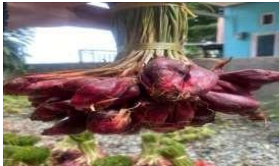
Figure 1. Dayak onion samples ( Eleutherine palmifolia (L.) Merr.)

Indonesian people have long known and used medicinal plants as part of their efforts to overcome health problems. Knowledge about medicinal plants is based on experience and skills that have been passed down from generation to generation. Many herbal medicines have been widely accepted in almost all countries in the world. According to the World Health Organization (WHO), countries in Africa, Asia, and Latin America use herbal medicines as a complement to the primary treatment they receive. The advantage of herbal medicine lies in its natural ingredients so that side effects can be minimized. Dayak onion ( Eleutherine palmifolia (L.) Merr.) is a plant in the Kalimantan forest that is commonly used by the people of the interior of Central Kalimantan as a traditional potion or medicine.