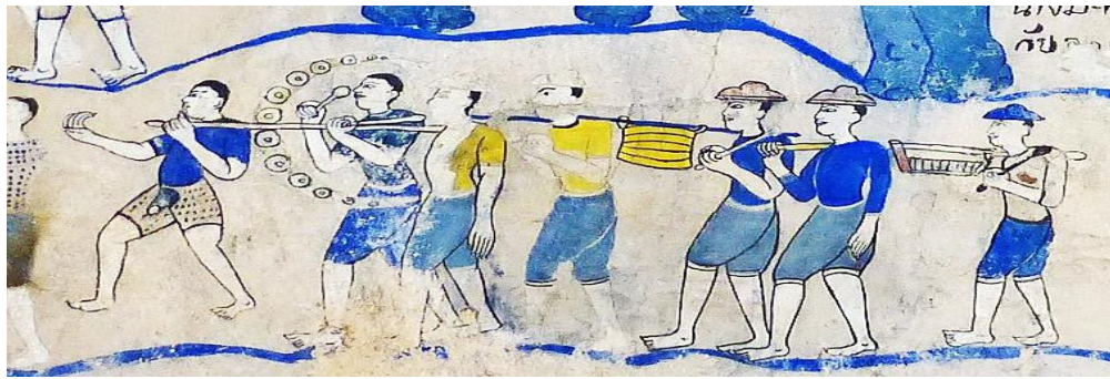
Figure 3: Image of the Piphat procession at Wat Sanuanwaree, Khon Kaen Province