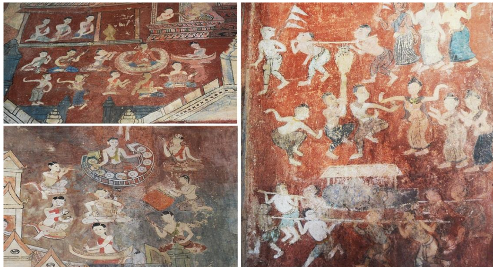
Figure 5: Mural Paintings at Wat Thung Si Mueang

the inclusion of khaen playing and Mor Lam singing, both in performances and in the Isan funeral procession known as Ngan Huean Dee. Wat Ban Na Khwai and Wat Sadao Nong Khu Rattanaram reflect the influence of mural painting through the study of Buddhism by monks who learned from Wat Thung Si Mueang.