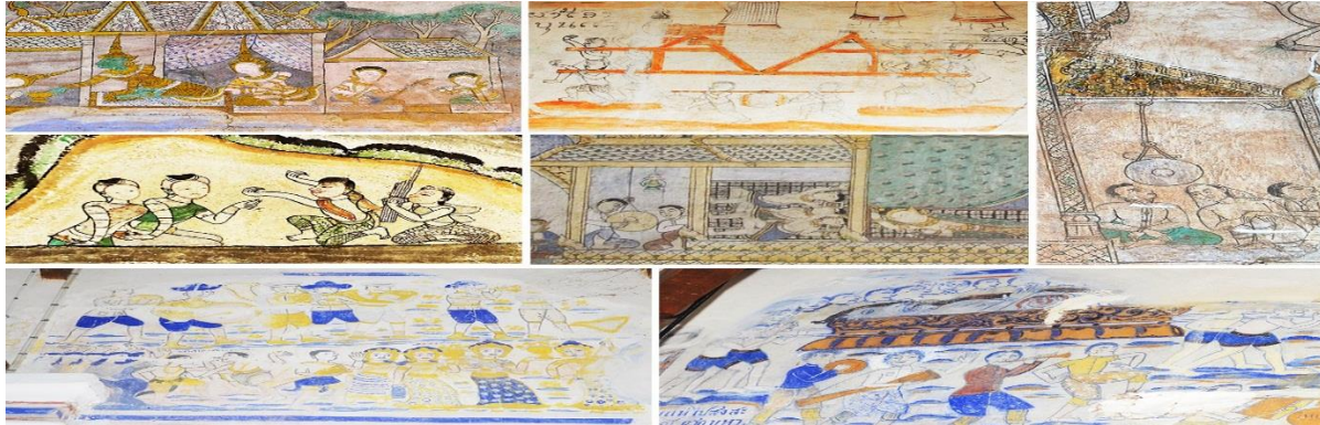
Figure 6: Mural paintings of the Isan Culture Group along the Mekong River in Nakhon Phanom

nighttime. The artist painted scenes of people waiting to strike a gong to signal different times throughout the night. Additionally, the painting at Wat Phra Sri Maha Pho in Mukdahan Province depicts an angel playing the saw u (a two-string fiddle with a coconut shell body) and blowing the pi (a type of quadruple reed instrument) as a lullaby next to Indra's throne. This may have been influenced by the practice of using music to serenade the upper class, a tradition from the central region's music culture of that time (Shown in Figure 6).