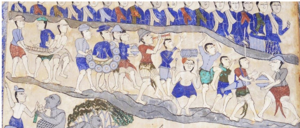
Figure 4: Image of the Piphat procession at Wat Yang Thuang Woraram, Maha Sarakham Province