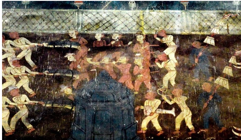
Figure 1: The Trae Ngong, an old Thai horn, is depicted as being played to lead the royal procession.