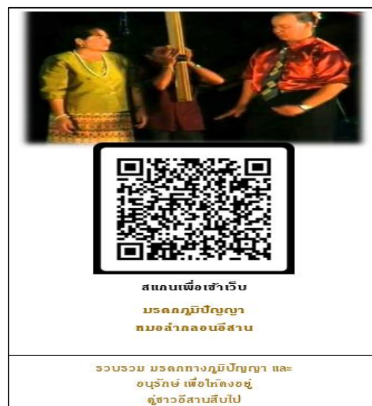
Figure 1: Example of access channels for the Mor Lam Klon website

2. Sharing knowledge, various knowledge is shared through the website. “Mor Lam Klon Wisdom Heritage of Isaan” which has a toolbar on the home page of the website divided into 5 tabs: Mor Lam Klon tab, Mor Lam Klon 4 Sangwat tab, and Mor Lam Klon performing skills tab. Additional information and other information tab, E-book tab, Author tab, as in the example picture.