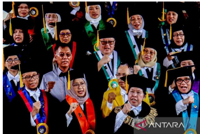
Figure 1: Documentation of the chairperson of the UI board of professors