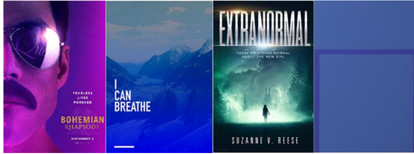
Image 4. Single color harmony graphic design work examples and Carmen Herrera work

effects by using single color harmony with different tones, shades, textures, patterns and lighting techniques.