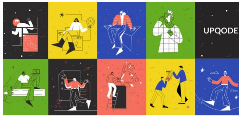
Image 2. Example of color application in graphic design

Accessed: 12.03.2022 https://www.awwwards.com/UPQODE/