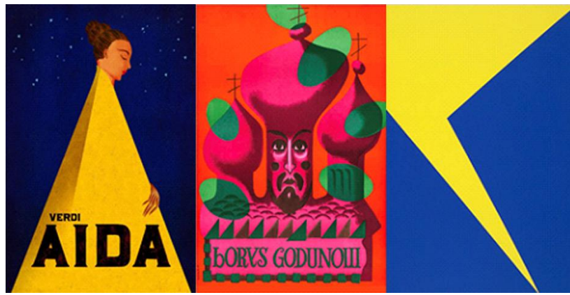
Image 6. Carmen Herrera Far Colors Harmony graphic design work samples

Accessed: 23.03.2022 https://tr.pinterest.com/pin/55872851598733090/