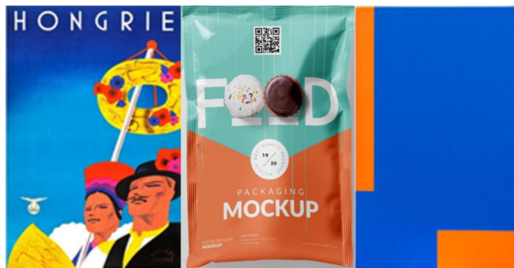
Image 7. Contrasting color harmony graphic design work examples and Carmen Herrera work

Harmony of Distant Colors: Harmonies consisting of distant colors and their mixtures are harmonies made with the three primary colors yellow-red-blue and their mixtures and intermediate colors. The harmony of distant colors played an important role in Carmen Herrera's works. The colors contrast with each other, attracting the viewer's attention and creating a sense of excitement and dynamism in the composition. The colors used give three dimensions to the works and attract the attention of the target audience to the work. In this way, the intended message is conveyed to the target audience. Herrera also uses geometric shapes effectively. Opposite (Complementary) Color Harmony: Opposite (complementary) color harmony is the color harmonies provided by red and green, blue and orange, yellow and purple and the intermediate colors formed by their mixture with each other.