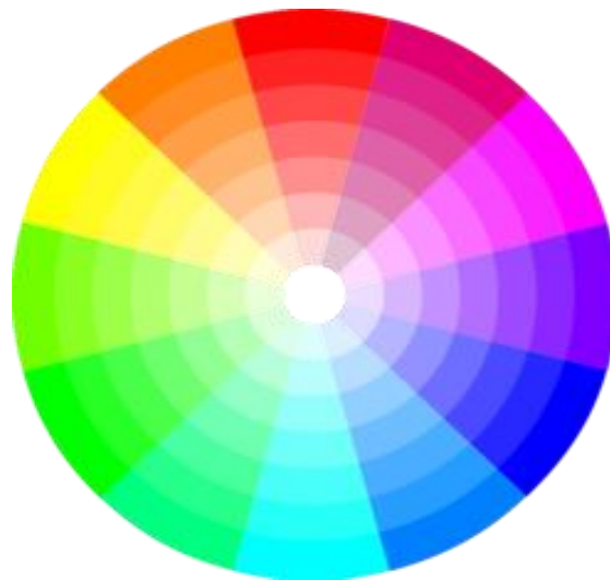
Image 3. Color wheel