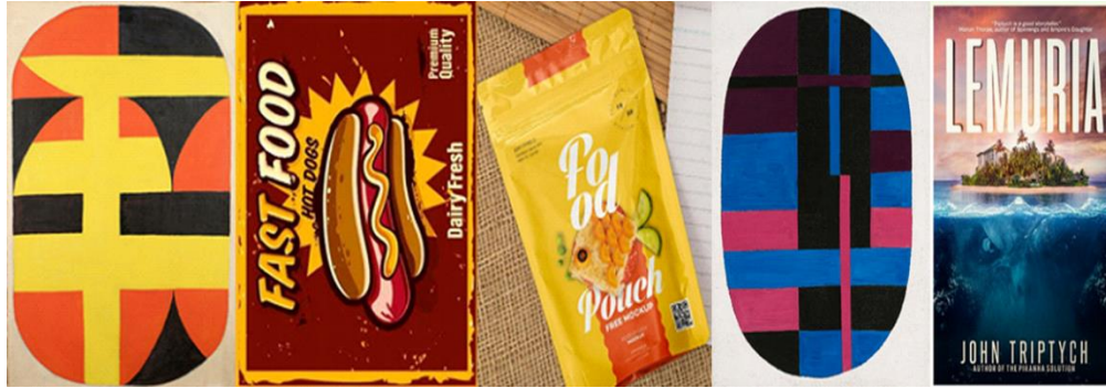
Image 8. Hot-cold color harmony graphic design work examples and Carmen Herrera work

yellow, which are warm colors, and blue-green-purple, which are cold colors, and intermediate colors consisting of mixtures. Warm Colors usually evoke a feeling of energy, enthusiasm and warmth. Cool Colors give a feeling of calmness, peace and coolness. Harmony adds a sense of energy, excitement and dynamism to Herrera's works.