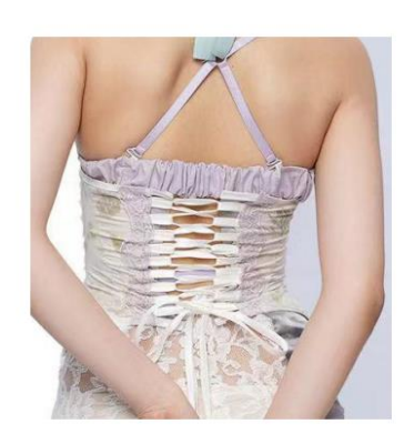
Figure 7: Design of shapewear style chart and display of finished products, Author: Wu Fangyuan, director: Wang Yujuan