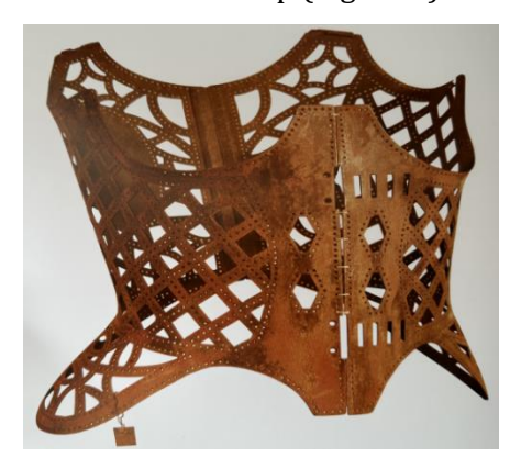
Figure 1: Metal corset, Museum of Fashion, Paris

Traditional tight corsets can be divided into two forms: one is made of perforated metal sheets, connected by hinges on both sides of the body, and belongs to the most powerful orthopaedic underwear, which is also the most harmful to the human body. Its shape is inverted and triangular (Figure 1). Another type of design is simple and decorative. It is based on the human body and achieves a straight and flat effect through the longitudinal splicing of fabrics on the chest, abdomen, and waist. It adopts multi-layer stiff fabric overlapping sewing, with multiple oblique divisions at the waist. Thin triangular pieces are inserted into the chest and waist to increase the bottom swing capacity, and whalebone is used to maintain and fix the shape at the division of the pieces, strengthening the contraction force of the tight corset (Wang, 2018), thus forming body-shaping underwear. The corset creates an S-shaped body curve for women through the external force of the garment from bottom to top (Figure 2).