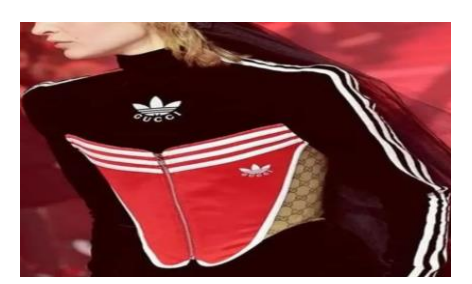
Figure 4: GUCCI and Adidas joint shapewear model

Designers can combine the cutting methods and decorative elements of corsets with fashion trends to create lingerie styles that are both in line with fashion trends and have their characteristics. For example, the lace and strap elements of the corset are integrated into modern lingerie design, which not only retains the vintage flavour of the corset but also adds a sense of fashion; or the shaping effect of the corset is combined with sports elements to create functional lingerie suitable for both daily wear and sports and fitness. In 2022, GUCCI and Adidas jointly launched a sports shapewear that combines the sexiness of traditional fishbone bras with a casual sports style, forming a mixed style (Figure 4). Modern shapewear design also emphasizes innovation in colour and pattern, creating more visually impactful effects through bold colour combinations and unique pattern designs. Lingerie designer Cheng Xiaohong incorporated traditional Chinese plum blossom patterns into shaping lingerie design through embroidery and digital printing (Figure 5). She aimed to highlight the curves of the human body, borrowed the structural segmentation form of tight corsets, and designed modern underwear products that are both plastic and trendy through the thickness relationship of fabrics and the contrast relationship of patterns.