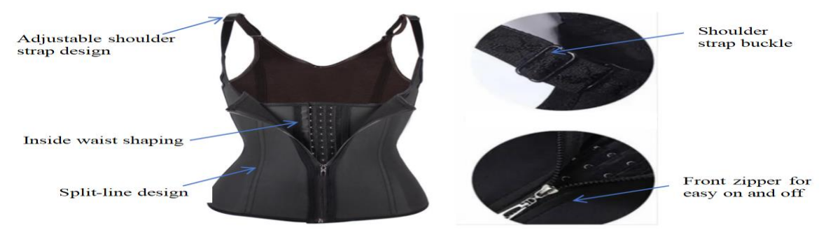
Figure 3: Multi-functional modern shapewear design, Pinsen Clothing, 2023

The detachable shoulder strap design allows underwear to be easily converted into strapless or cross shoulder strap styles, suitable for pairing with various clothing, increasing the convenience and fashion sense of wearing. The convertible vest style allows underwear to be worn as a fashionable item for outerwear. These structural and functional optimizations not only enhance the practicality and comfort of underwear, but also meet the personalized and diversified needs of modern consumers.