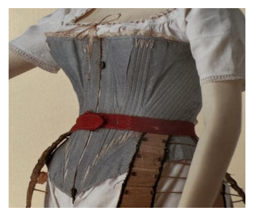
Figure 2: Blue silk corset, Victoria Museum, London