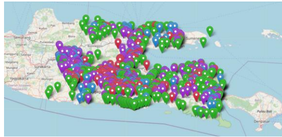
Figure 1. Map of the Distribution of Tourism Destinations in East Java in May 2024

cultural tourism, artificial tourism and tourism villages. (Sistem Informasi Data Jawa Timur, 2024) According to the distribution data of Tourist Destinations in East Java