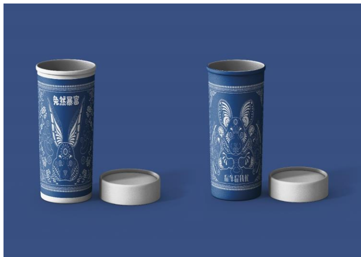
Figure 7: Digitally-designed cups