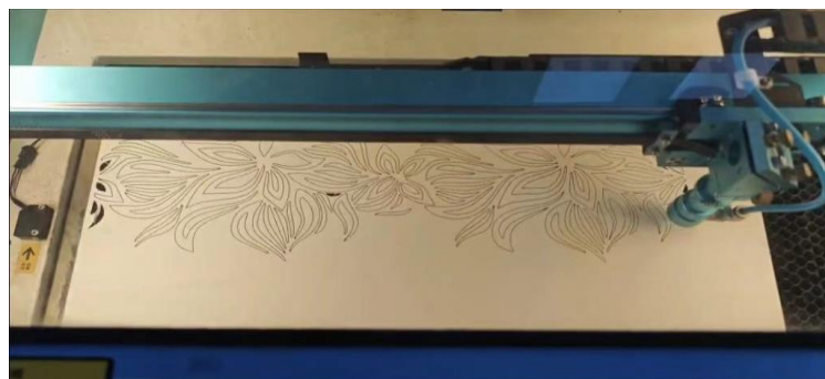
Figure 9: Stencil made by laser engraving