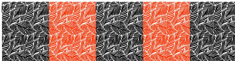
Figure 8: Pattern designed by using digital design tools

These innovative designs are widely used in product types such as home decoration, fashion accessories and household utensils. They have created new market opportunities for blue calico. By combining modern digital technology and traditional handicrafts, Nantong blue calico retains its cultural characteristics, and has modern aesthetic value, which meets the needs of contemporary consumers for personalized and diversified products, thus enhancing its market competitiveness and achieving a win-win situation between culture and market. In the future, with the continuous progress of digitalization and personalized customization technology, blue calico will radiate new vitality in more application fields, and promote its sustainable development and modern innovation.