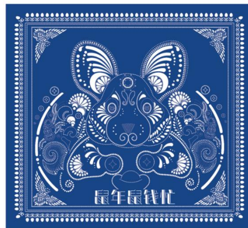
Figure 4: "Rat makes you rich" scheme based on the digital reconstruction design of traditional materials