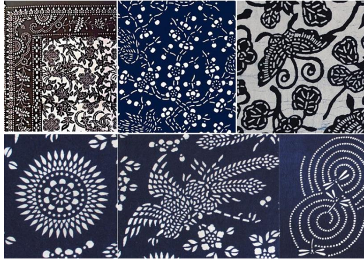
Figure 5: Elements extraction and processing of traditional patterns by using digital design software