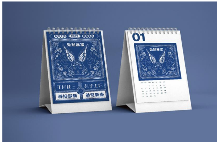
Figure 6: Digitally-designed desk calendars