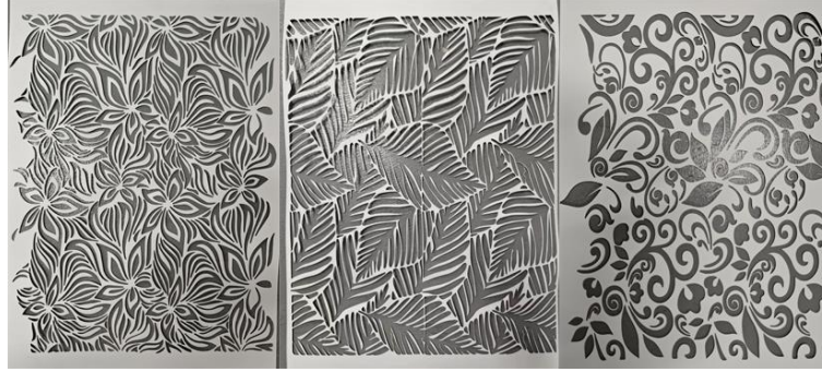
Figure 10: Stencil completed by digital engraving