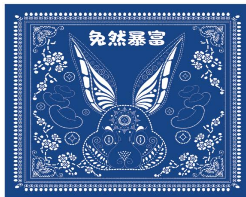
Figure 3: "Rabbit makes you suddenly rich" scheme based on the digital reconstruction design of traditional materials

In the future, with the continuous growth of personalized customization market demand, digital design will further promote the innovation and development of blue calico. Consumers' pursuit of unique design and cultural elements makes traditional patterns show broad market potential in modern design. Through high-precision laser engraving technology and digital design software, designers can efficiently carry out repeated experiments and iterations, improve the accuracy and consistency of the design, greatly shorten the development cycle, and thus promote the sustainable development of blue calico in modern innovation.