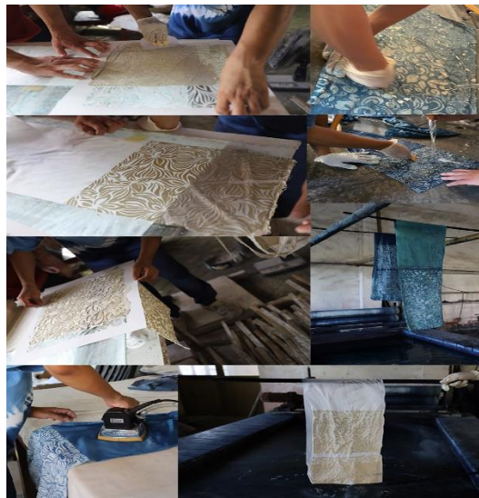
Figure 11: Use digital engraving to complete the stencil and then produce blue calico fabric products