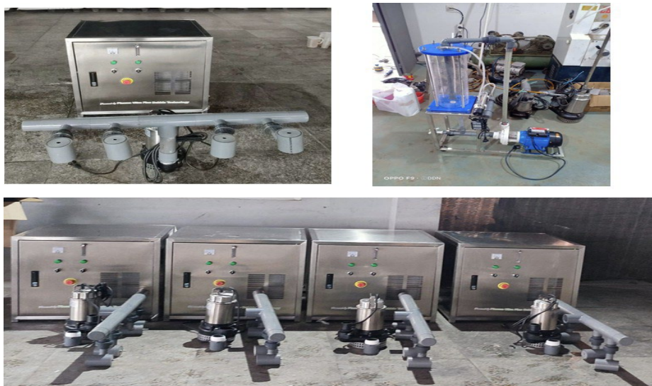
Figure 2: Fine bubble plasma technology display

In the management of seaweed liquid waste, which currently still uses a lot of treatment chemicals , PFB technology can be a solution to produce liquid waste that is more environmentally friendly. Seaweed has a high amino acid content, so the seaweed processing industry produces waste that tends to smell and has a fairly high nitrite value. Plasma technology that produces ozone and is injected using fine bubble nozzles in seaweed wastewater can quickly decompose ammonia into nitrate and reduce Chemical Oxygen Demand (COD) and Biological Oxygen Demand (BOD) so as to produce water that meets quality standards to be circulated as wastewater to plantations and community rice fields.