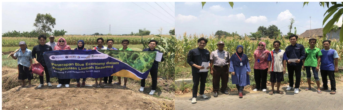
Figure 4: Field survey with Farmers around the location of PT Hakiki Donarta