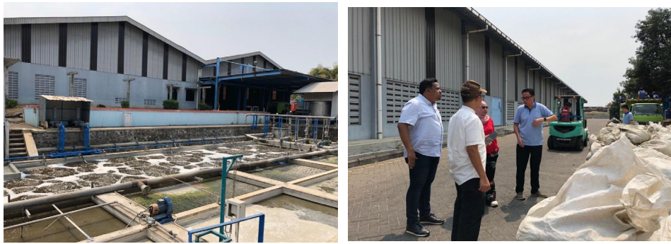
Figure 2: Observation at PT Hakiki Donarta