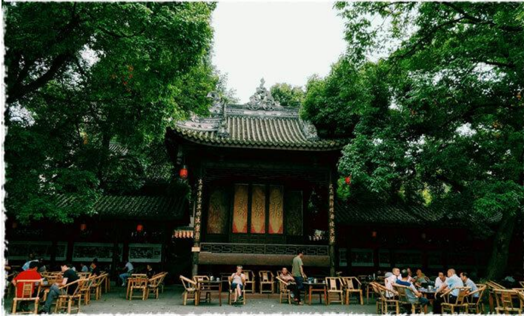
Figure 1: Chaguan Teaspot (Source: Zhu et al., 2023)