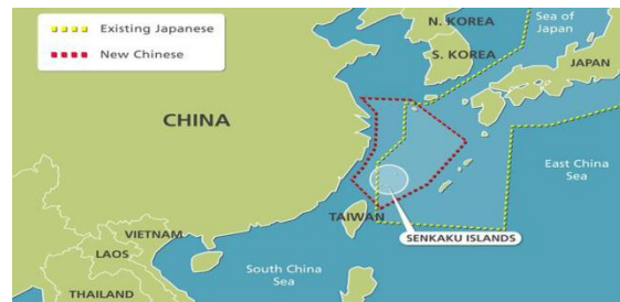
Figure 1: https://officerspulse.com/wp-content/uploads/2021/03/pasted-image-0-34.png

The Senkaku Islands chain is a series of five islands full of fish and oil riches, islands located in the disputed East China Sea by China and Japan, with an area of 5.43 km 2 It has been under Japanese control since 1972, and is called the Senkaku Islands in Japanese, and Diaoyu in Chinese 21 .