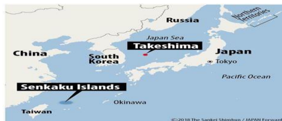
Figure 5: https://japan-forward.com/wp-content/E5%B0%96%E9%96%A3%E8%AB%B8%E5%B3%B6.jpg