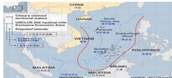
Figure 1: https://qph.fs.quoracdn.net/main-qimg-c0762e255bc09764bfc3343cb5b0ae0d-c

The sovereign conflict over the South China Sea is one of the most prominent in the continual and complex changes and fluctuations in the Pacific and Indian region, in which seven countries are battling (US, India, Australia, Japan, South Korea, China, and Vietnam) for claiming sovereignty over the sea, as well as external interventions aimed at protecting its strategic interests and driving China's risk there, including conflicts over critical strategic areas such as the Spartley Islands, Parcel Islands and coral reefs, as well as where energy sources are located. Despite the historical background of the nature of the conflict in the South China Sea 1 , China's publication of the nine-line map below has heightened tensions, with China demonstrating its sovereignty over 90% of the sea, and the conflict escalated in 2015 when China began building artificial islands in an attempt to progressively extend its territory and control over the sea. The Chinese Government considers that a large part of its internal legitimacy is linked to the extent to which it continues to maintain its acquisitions in the South China Sea, prompting it to continually engage in exploitative business in the region to control it 2 .