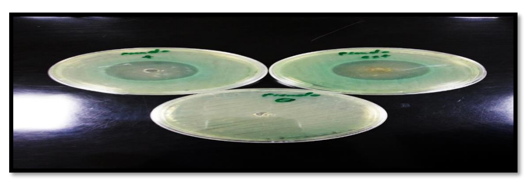
Fig (2): Antimicrobial Activity of Cefotaxime against Pseudomonas aeruginosa

The results shown in Figure 2 are noteworthy because they indicate that Cefotaxime successfully hindered the growth of all the tested isolates at various dilutions (1/2, 1/4, 1/8, 1/16, and 1/32). The experiment's findings revealed that the minimum inhibitory concentration (MIC) of 1/8 successfully inhibited bacterial growth. The isolates were chosen based on their inhibition zone diameter and resistance to Cefotaxime. The findings indicated a statistically significant impact (p < 0.05) of Cefotaxime on Pseudomonas aeruginosa isolates (2, 3, 4, 8, 9, 10) compared to other isolates.