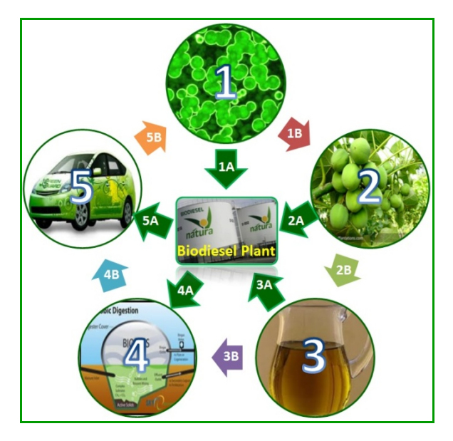
Fig. 2: Integrated Bioenergy System; Biorefinery concept Circle 1: Represents the growth of microalgae using waste-water; 1A: Lipids from microalgae may be supplied to biodiesel plant, 1B: Algal biomass after lipid extraction may be used as fertilizer to grow other energy crops. Circle 2: Represents the growth of oil seed crops using waste materials from Biodiesel plant; 2A: Use of seed oil for biodiesel production, 2B: Extraction of seed oil for human consumption. Circle 3: Represents the Seed oil extracted from either food or non-food crops; 3A: Oil can be converted to biodiesel, 3B: Plant biomass after lipid extraction can be used to produce bio-methane, bio-hydrogen, or other biological gases for industrial consumption. Circle 4: Biogas production; 4A: Use of waste from Biodiesel plant for biogas production, 4B: Supply of biogas to end user. Circle 5: Consumption of bio-diesel; 5A: Biodiesel supplied to the transport system, 5B: Carbon dioxide emission will be re-cycled by the field grown microalgae.

established during wastewater treatment and a maximum lipid productivity of 24 mg L<sup>-1</sup>d<sup>-1</sup> have been reported (Woertz et al., 2009). Other microalgae, for instance, Botryococcus braunii is widely distributed on all continents in freshwater, brackish and saline lakes and is able to accumulate unsaturated long-chain hydrocarbons at a concentration of 15% to 75% of its dry weight (An et al., 2003; Orpez et al., 2009) but still we need optimize the desired conditions for each water source. An interesting strain of Scenedesmus sp. LX1 showed biomass yield (0.11 g L<sup>-1</sup>), lipid contents (31– 33%) and a lipid productivity (8 mg L^{-1} d^{-1} ) in a batch culture using secondary effluent as growth medium (Li et al., 2010b) which are encouraging results. Moreover, LX1 was shown to have considerable removal of total nitrogen (90.4%) and total phosphorus (nearly 100%) in another study. When ammonium was used as the